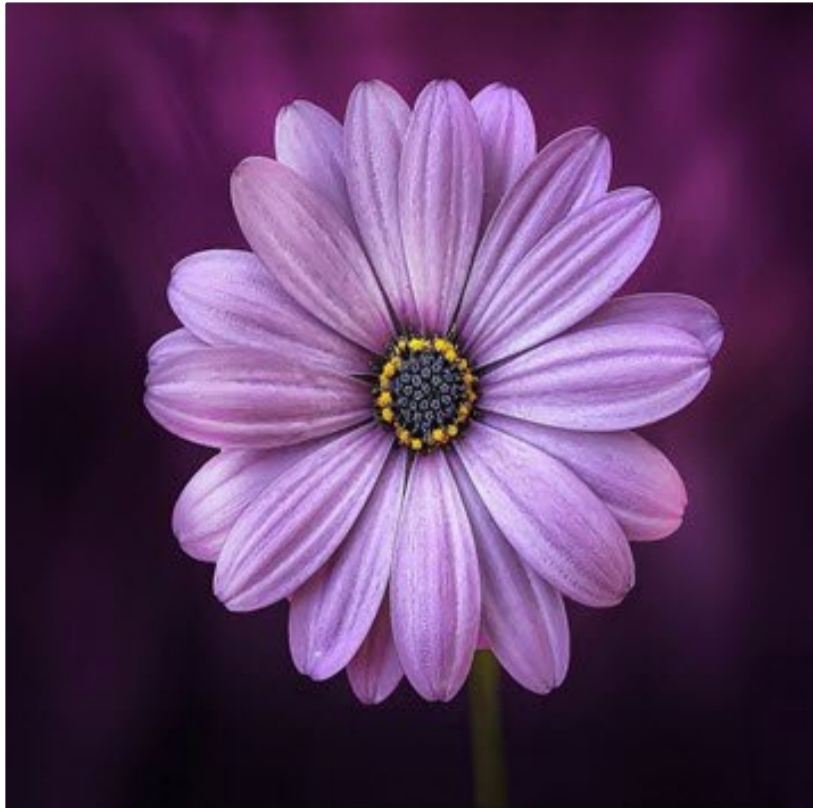
Funeral arrangement under the care of Keck - Coleman Funeral Home