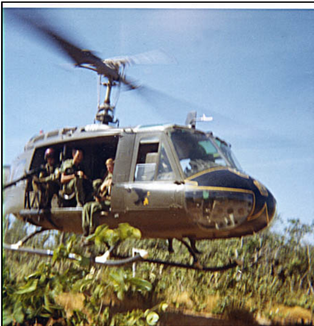
D 2/1 Cav Huey with Troops